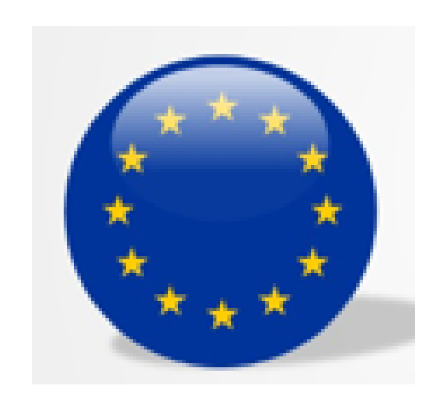
100% EU compensated