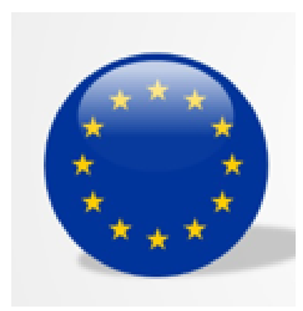
100% EU compensated